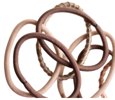
Bobby Pins & Hair Ties – Hair Colored