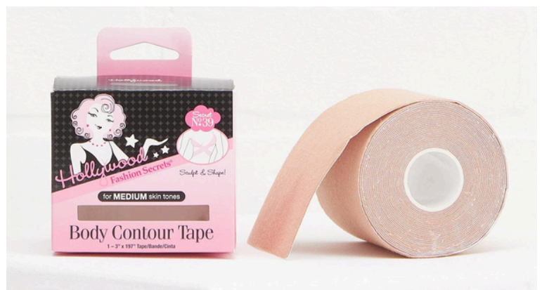
Booby Tape Or Stickers